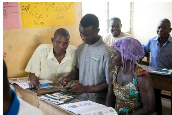
Use of calculator