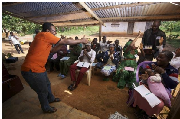
FBS in action Enthusiasm

Over 480,000 cocoa producers (29% women) in Côte d'Ivoire, Ghana, Cameroon, Nigeria and Togo participated in FBS trainings under Sustainable Smallholder Agri-Business (SSAB), ABF's precursor project. Since 2012, 40 other development programs, their partners, national organizations and 2 companies adapted FBS with support from SSAB for 39 value chains other than cocoa. In total, about 1,500,000 smallholders (33% women) in 25 African countries have undergone FBS training.